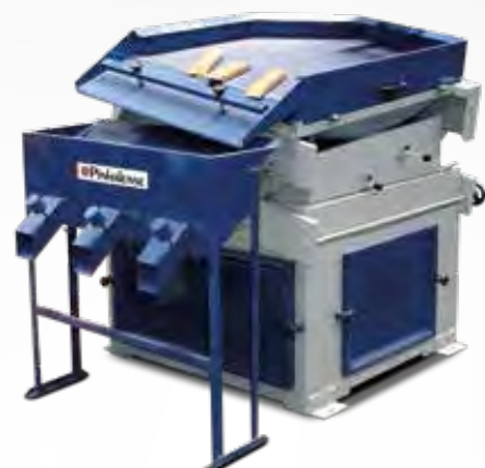
SEPARADORA DENSIMETRICA - MVF GRAVITY SEPARATOR - MVF capacidad/ capacity : 500 - 3.000 kg/h