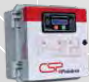
CONTROLADOR DE SECADO PINHALENSE - CSP PINHALENSE DRYING CONTROL SYSTEM - CSP