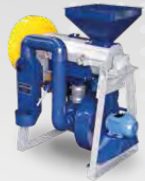
TRILLADORA Y PULIDORA - DBD-05 HULLER AND POLISHER - DBD-05

Conjunto de trilla, pulido e selección. Combined set to hull, polish and size grade. capacidad/ capacity : 300 kg/h (café almendra/ green coffee )