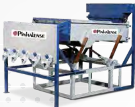
CLASIFICADORA DE TAMAÑO DE FLUJO ASCENDENTE - PFA UPWARD FLOW SIZE GRADER - PFA capacidad/ capacity : 300 - 1.800 kg/h