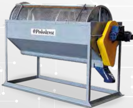
CRIBA TUBULAR DE SELECCIÓN PARCHMENT SEPARATOR