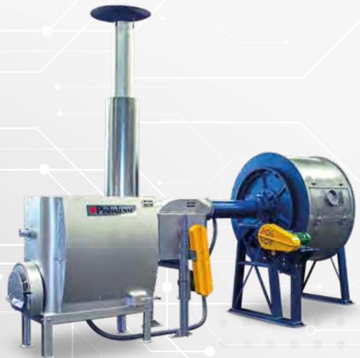
SECADORA ROTATIVA - SRE ROTARY DRIER - SRE capacidad/capacity: 500 - 5.000 kg