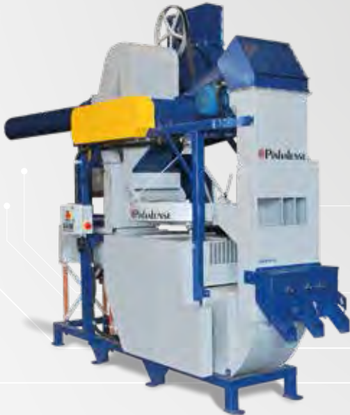
TRILLADORA COMPACTA COMBINED HULLER COMPACTA

Conjunto compacto de prelimpeza, despedregado, trilla e selección. Combined unit to clean, destone, hull, repass and sort coffee. capacidad/ capacity : 60 - 600 kg/h (café almendra/ green coffee )