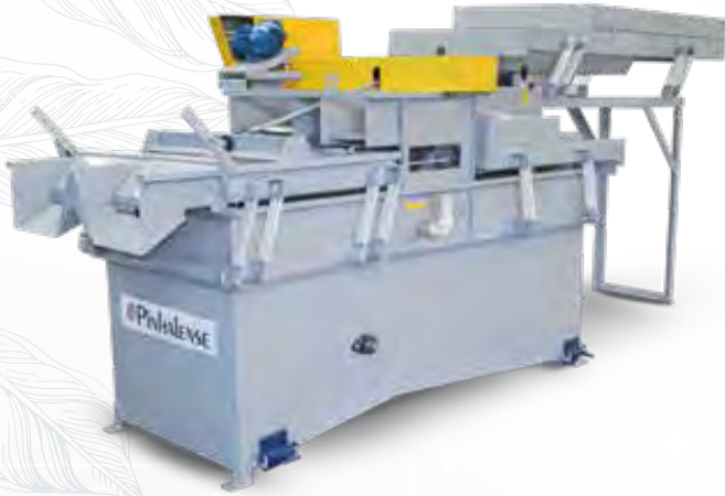
SIFÓN MECANICO PARA CAFÉ COFFEE WASHER AND SEPARATOR capacidad/ capacity: 2.000 - 6.000 Kg/h