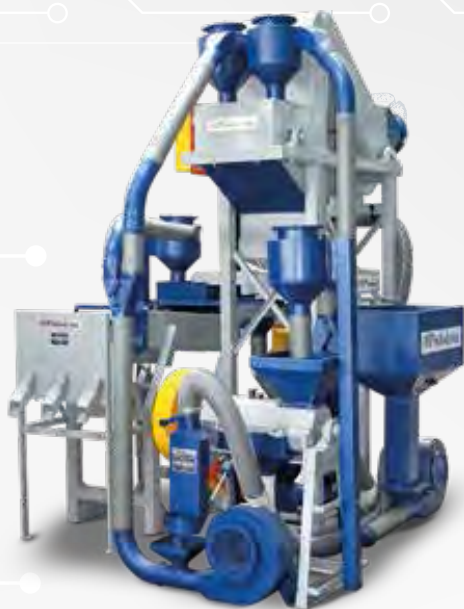
TRILLADORA DE MICROLOTES - C2DPRC MICROLOT MILL - C2DPRC

Conjunto de trilla, pulido e selección. Combined set to hull, polish and size grade. capacidad/ capacity : 300 kg/h (café almendra/ green coffee )